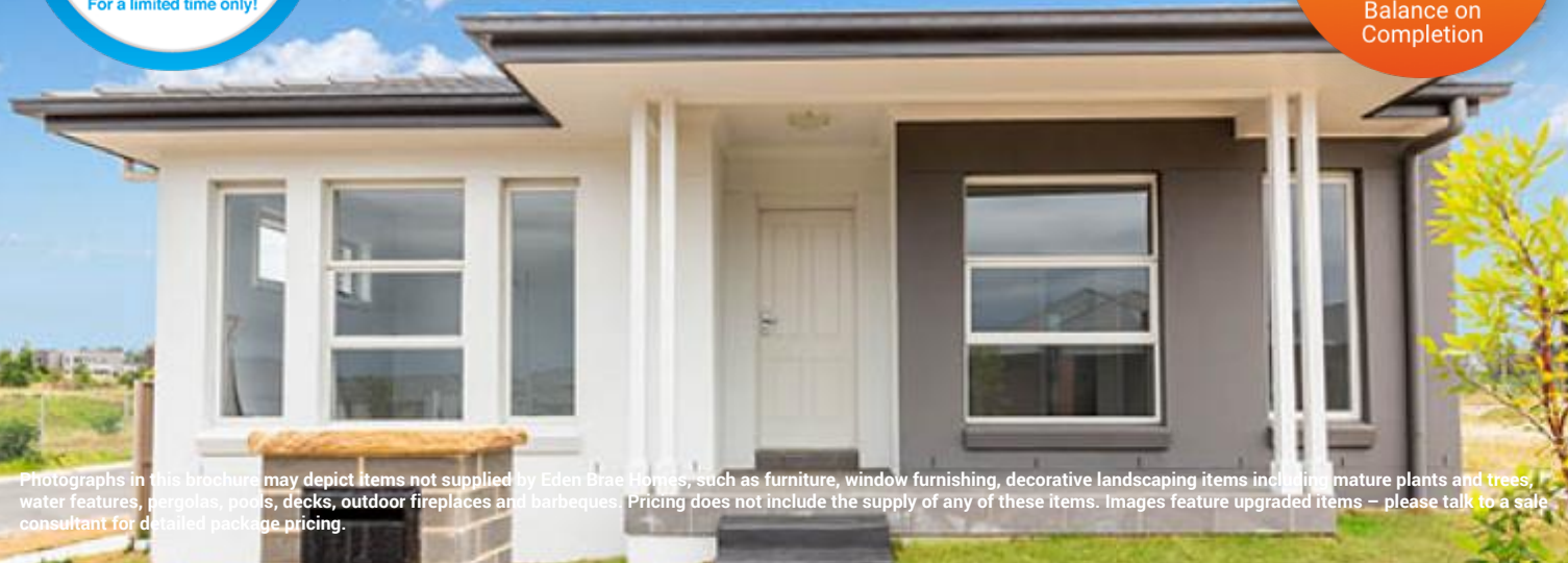
Photographs in this brochure may depict items not supplied by Eden Brae Homes, such as furniture, window furnishing, decorative landscaping items including mature plants and trees, water features, pergolas, pools, decks, outdoor fireplaces and barbeques. Pricing does not include the supply of any of these items. Images feature upgraded items – please talk to a sales consultant for detailed package pricing.