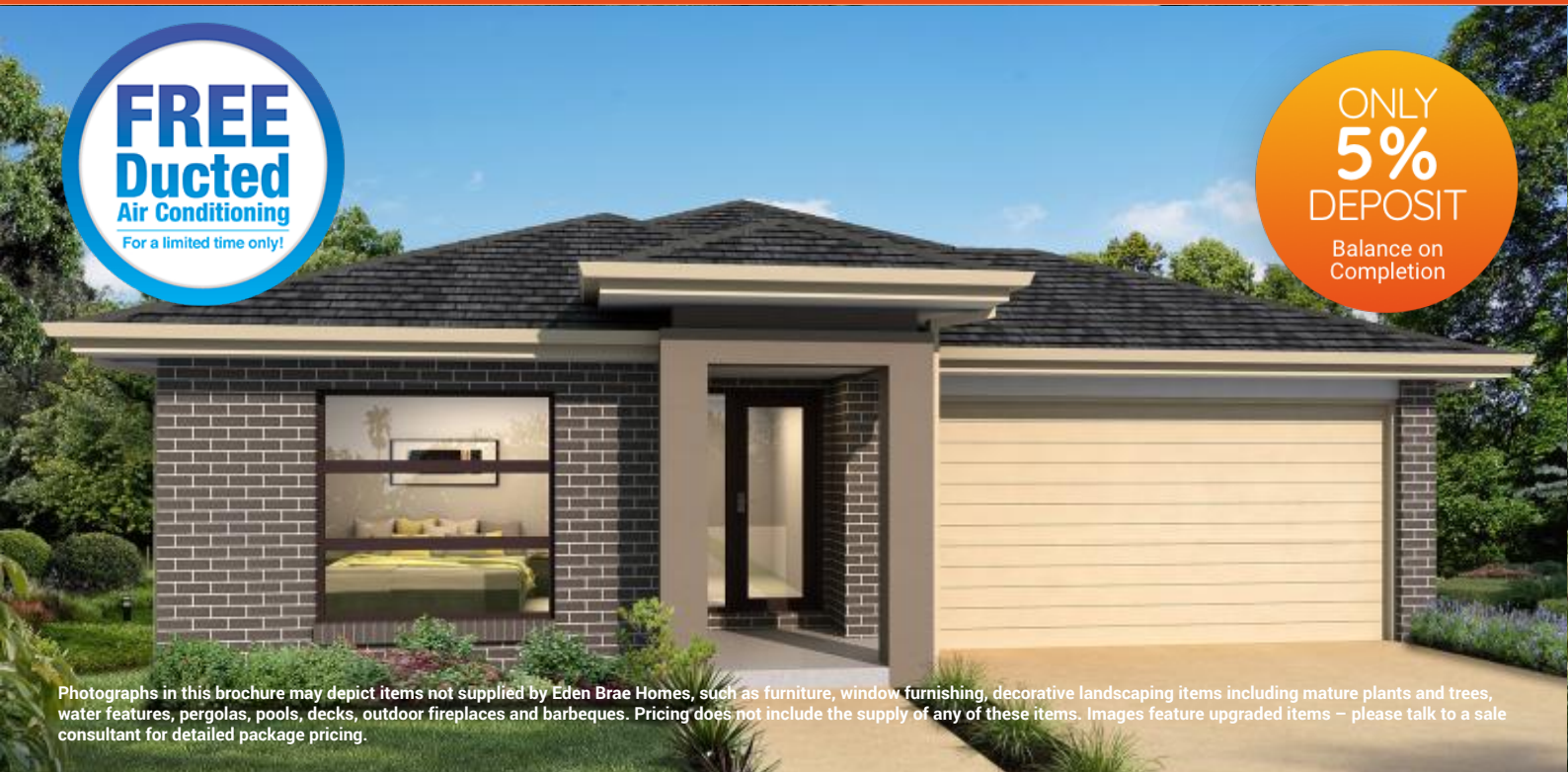
Photographs in this brochure may depict items not supplied by Eden Brae Homes, such as furniture, window furnishing, decorative landscaping items including mature plants and trees, water features, pergolas, pools, decks, outdoor fireplaces and barbeques. Pricing does not include the supply of any of these items. Images feature upgraded items – please talk to a sale consultant for detailed package pricing.