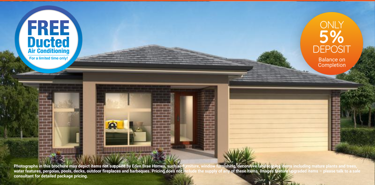
Photographs in this brochure may depict items not supplied by Eden Brae Homes, such as furniture, window furnishing, decorative landscaping items including mature plants and trees, water features, pergolas, pools, decks, outdoor fireplaces and barbeques. Pricing does not include the supply of any of these items. Images feature upgraded items – please talk to a sale consultant for detailed package pricing.