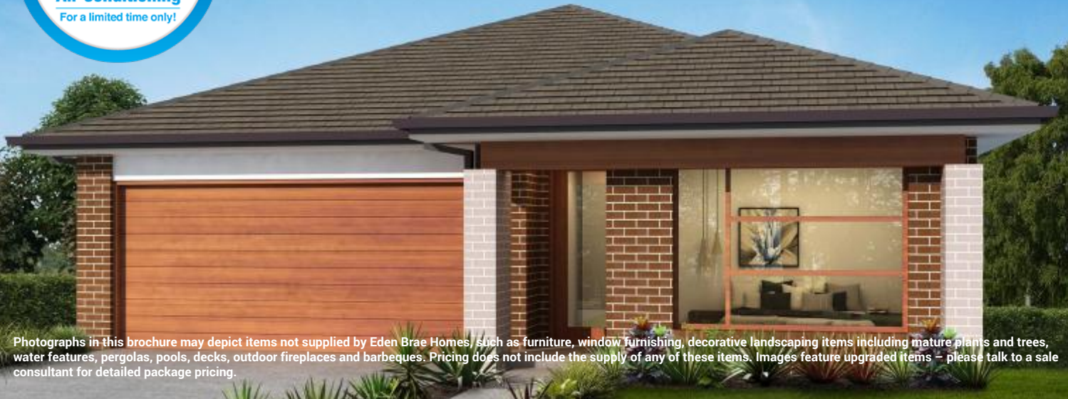
Photographs in this brochure may depict items not supplied by Eden Brae Homes, such as furniture, window furnishing, decorative landscaping items including mature plants and trees, water features, pergolas, pools, decks, outdoor fireplaces and barbeques. Pricing does not include the supply of any of these items. Images feature upgraded items – please talk to a sales consultant for detailed package pricing.

FREE Ducted Air Conditioning For a limited time only!